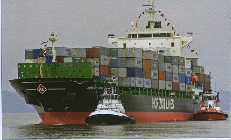
The HORIZON HAWK, with an M.E.B.A., MM&P & SIU crew aboard, is the second of five Hunter-class newbuilds that Horizon is bringing into its fleet.

Members should pre-enroll for TWIC on the TSA Web site ( www.tsa.gov/twic ). Pre-enrollment speeds up the process by allowing workers to provide biographic information and schedule a time to complete the application process in person. This reduces waiting and in-person enrollment times for each individual. Once you enter your information and create a username and password online you need to schedule an appointment at one of the enrollment centers. This can be accomplished by calling the TWIC help line at (866) 347-8942. It should be noted that the enrollment centers are still being established and there may not be one in your area at this time. For your appointment, you will need to bring identification