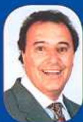
AL CAMELIO LOS ANGELES BRANCH AGENT