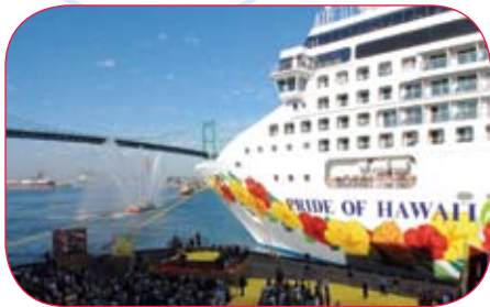
The PRIDE OF HAWAII, crewed with MEBA officers in all licensed positions, was recently christened in L.A.

Members or applicants two or more years in arrears on their dues and/or service charges will be reviewed by the District Investigative Committee in December and likely dropped from the membership or applicant rolls. If you are in arrears and want to retain your membership or applicant status, you must contact Headquarters immediately to make payment on your arrearage to return to good standing.