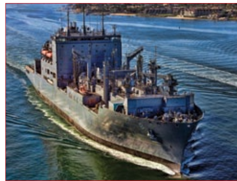
A photo of the USNS WALLY SCHIRRA, which was recently delivered into the MSC fleet with M.E.B.A. engineers aboard. Another MSC vessel, the USNS MATTHEW PERRY, was launched in August. NASSCO recently began work on the 12th ship in the program, the USNS WILLIAM McLEAN.

Coordinator by calling them toll free. The toll free telephone number is (877) 324-6322. Normal operating hours for the Travel Coordinator are generally Monday through Friday from 9:00 a.m. until 7:00 p.m., Eastern Standard Time (6:00 a.m. until 4:00 p.m. Pacific Standard Time).