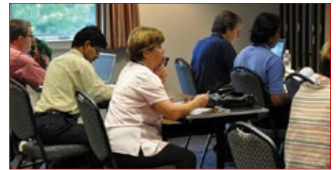
The Calhoun M.E.B.A. Engineering School staged such a successful e-learning conference that it will now become an annual event.

The conference was set up to further progress toward a more widespread use of this technology and to provide the industry with a better understanding of the complexities involved in getting course approval from